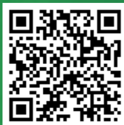
BBC Bitesize History

Use online revision tools like BBC Bitesize at home to improve your history knowledge even more.